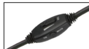
In-line Volume Control