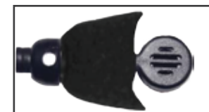
Proprietary Microphone Design